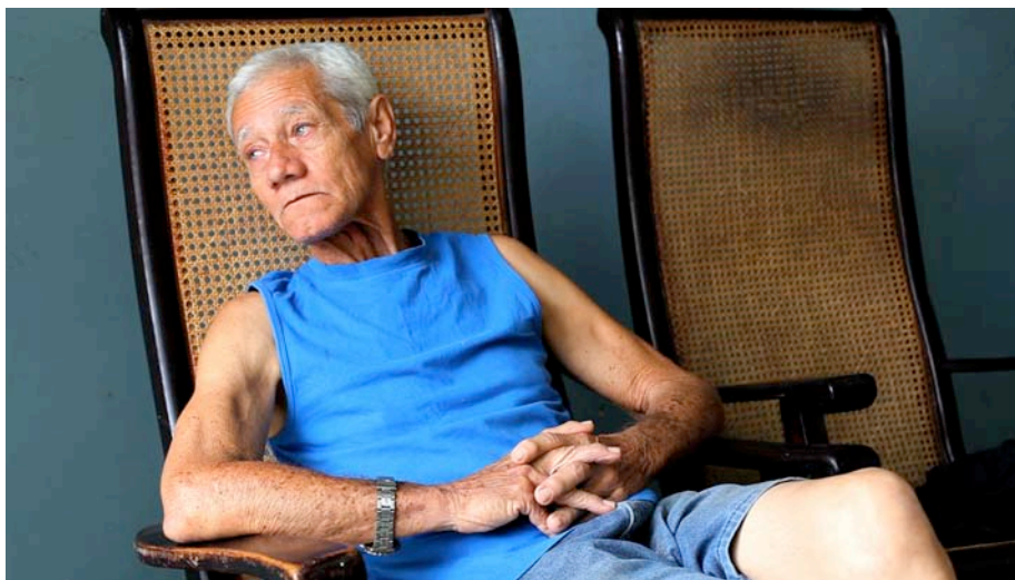
Figure 1: Vainilla Chip (2009).

In my own work, I try to work on developing these transcendental qualities to my approach and form. One example is the documentary, Vainilla Chip (Knudsen, 2009), 7 and the forthcoming feature film, The Silent Accomplice (Knudsen, 2010).