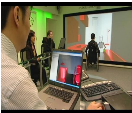
Figure 2 The wheelchair user is testing the bathroom's layout using the digital mock up during the meeting

Immersive Virtual Reality is used here to produce the digital mock up in an attempt to replace the physical one in this scenario, so the meeting does not end here, but it carries on where changes can be applied by the various stakeholders as they discuss their viewpoints. Once all changes are made, the wheelchair user starts testing the bathroom's model for the second time. Once an acceptable solution for a new design layout is agreed, the meeting ends with a definitive validation of the design, and the participants can then return to their everyday work without the need for further meetings to be organised and for physical mock-ups to be modified.