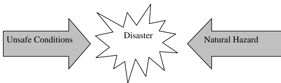
Figure 2: Components of a disaster

Thereby, the threat from natural hazards can only be minimised through the elimination of unsafe conditions, as much as possible, in terms people, property and infrastructure. The role of the pre-disaster risk reduction phase, also referred as development portion, is considered to be vital in bringing unsafe conditions to a controlled safe environment, through mitigation and preparedness.