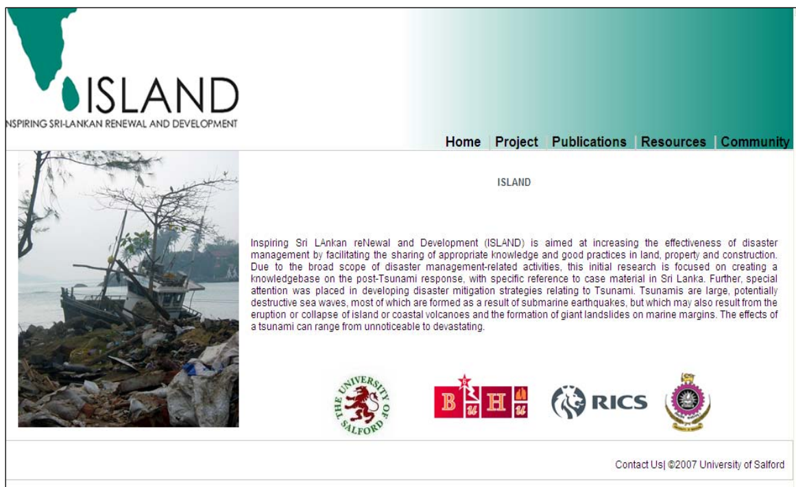
Figure 3: ISLAND website - Home page

As part of WP 1, the ISLAND web portal and knowledgebase was developed to capture, process, and disseminate the lessons learned from the Indian Ocean tsunami in the form of policy advice and good practices to guide future post-disaster interventions. Hence, the web portal provides an organised common platform to capture, organise and share the knowledge on disaster management strategies and create a versatile interface among users from government, professional bodies, research groups, funding bodies and local communities.