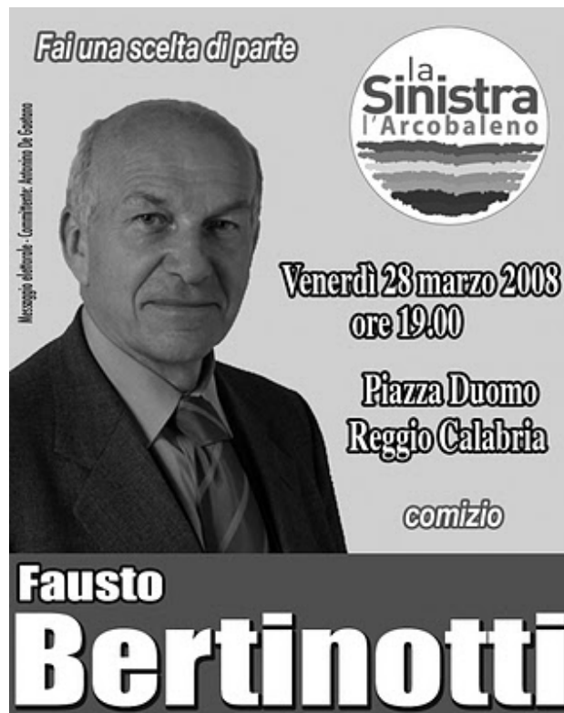
Figure 2: 2008 election campaign poster featuring SA leader, Fausto Bertinotti