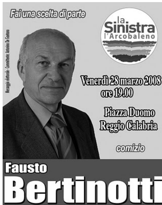
Figure 2: 2008 election campaign poster featuring SA leader, Fausto Bertinotti

Source: Barisione and Catellani (2008: 138; table 10.1)