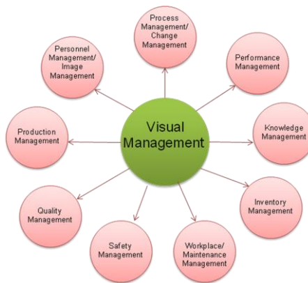
Figure 2: Visual Management and Its Relations

Visual Management takes supportive role in other managerial practices. Visual production control, the Kanban; visual workplace organization, the 5S or visual quality control, the Andon are some of various examples of these roles. The relations between Visual Management and other managerial practices can be seen in Figure 2