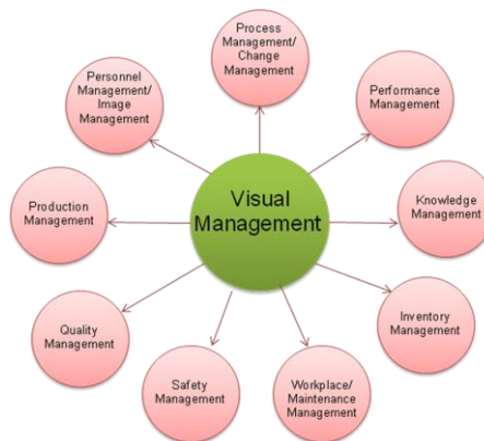
Figure 2: Visual Management and Its Relations

Visual Management takes supportive role in other managerial practices. Visual production control, the Kanban; visual workplace organization, the 5S or visual quality control, the Andon are some of various examples of these roles. The relations between Visual Management and other managerial practices can be seen in Figure 2