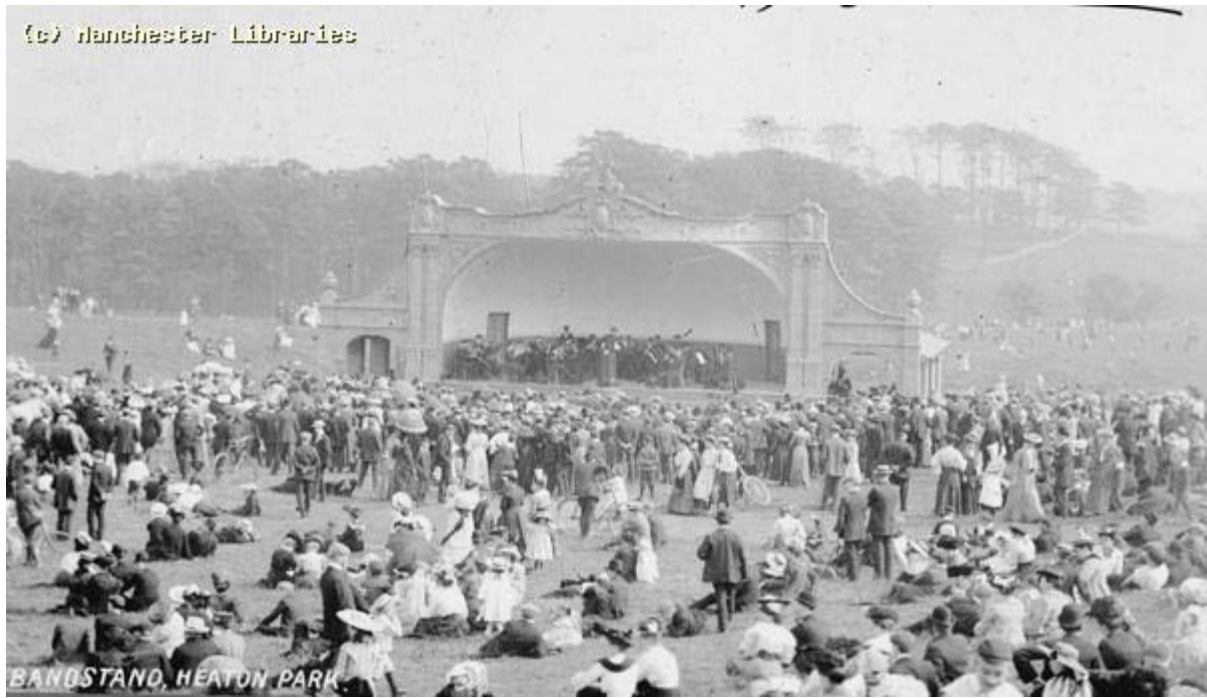
Figure 1 – Crowds near the Heaton Park bandstand, 1906