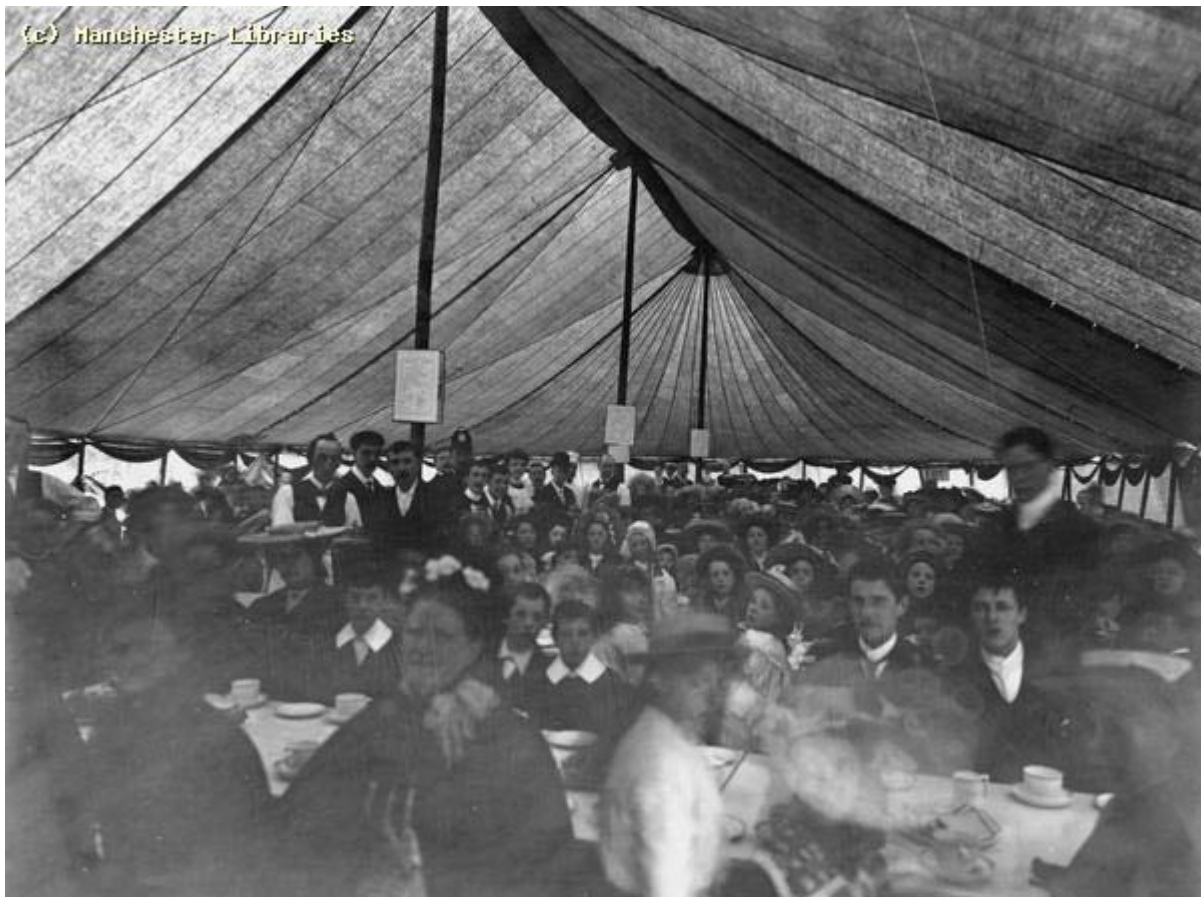
Figure 2 – Crowds in the refreshment tent at Heaton Park, 1906