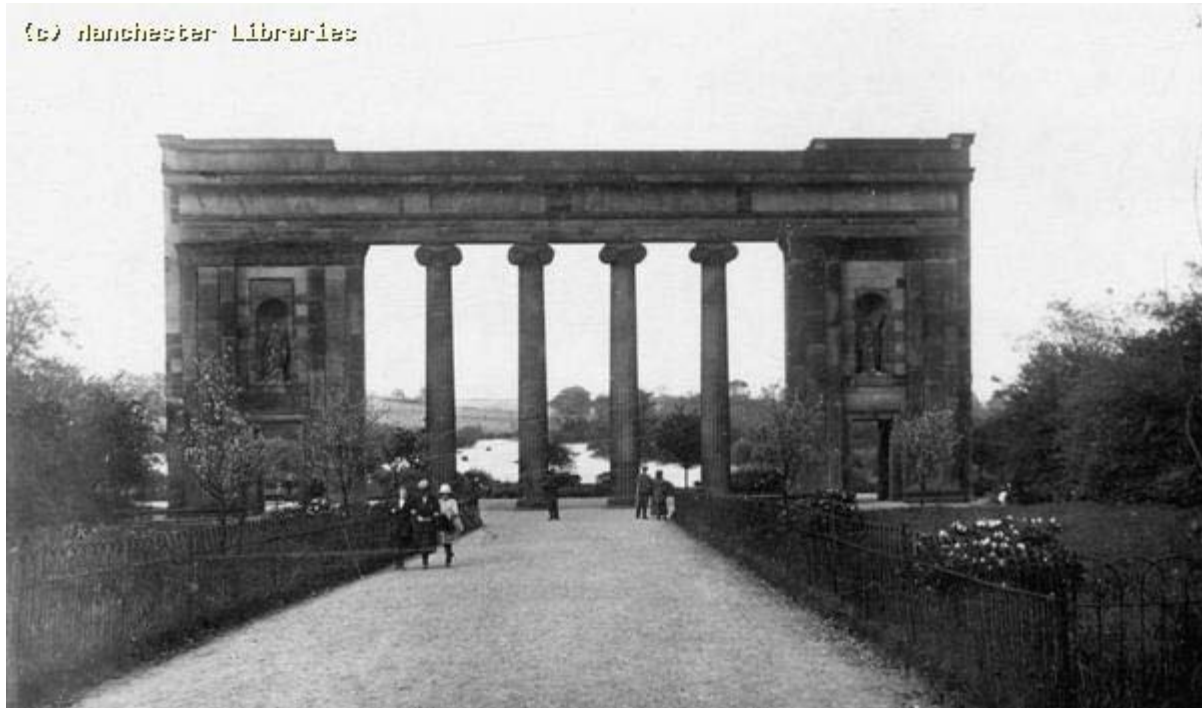
Figure 3 – The old Town Hall colonnade near the lake, Heaton Park 1913