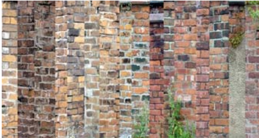
Figure 1 – The artists found 52 different shades of red present in brickwork along the length of a walk that cuts right through the centre of area.

REdGENERATION, a conflation of 'regeneration' and the dominant 'red' brick of the built environment.