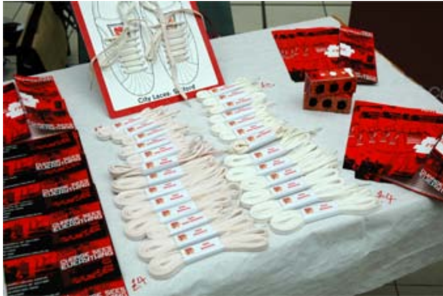
Figure 9 – REdGENERATION marketing and promotion material, including Salford Shoelaces.

The main arena for learning or gaining experience from the project was the group meeting at each session, in so far as the whole group shared their experiences and effectively provided a critique and appraisal of successes. Most of the contributors within the team quickly adopted a habit of team work when focusing on short term objectives, choosing to work in groups of 2 or 3. Infrequently, individuals chose to work independently.