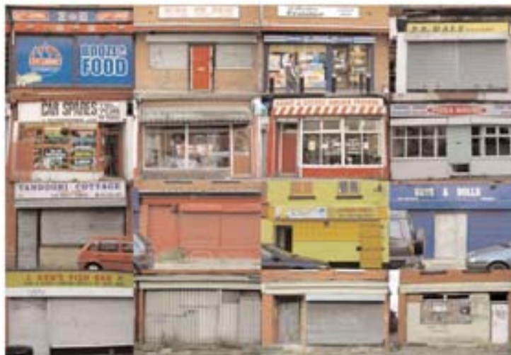
Figure 3 – Shopfronts in Lower Broughton and Charleston

The artistic content of the project is concentrated at the start. It has been important to the entire process that those people employed as artists are accepted and accept equal stakes in the project. Whether they are responsible for art as a consequence of the project is as circumspect as whether the young people in the project will adapt or use any art in their work. At the same time, the main function of artists employed by the project has been to make art! The artists are not qualified to make judgements about the nature, scale or solution to the problematic social or economic contexts that sponsor their engagement.