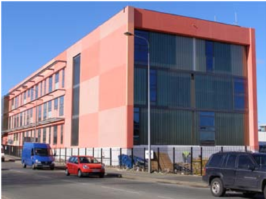
Figure 4 – The Innovation Forum Building ('Hub') and colours from the range of Salford Reds.