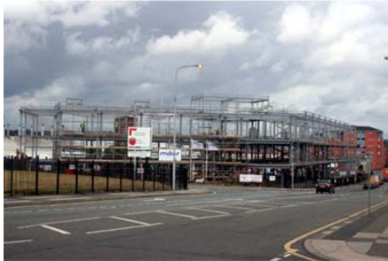
Figure 2 – New construction work on Frederick Road, Salford.

The artistic content of the project is concentrated at the start. It has been important to the entire process that those people employed as artists are accepted and accept equal stakes in the project. Whether they are responsible for art as a consequence of the project is as circumspect as whether the young people in the project will adapt or use any art in their work. At the same time, the main function of artists employed by the project has been to make art! The artists are not qualified to make judgements about the nature, scale or solution to the problematic social or economic contexts that sponsor their engagement.