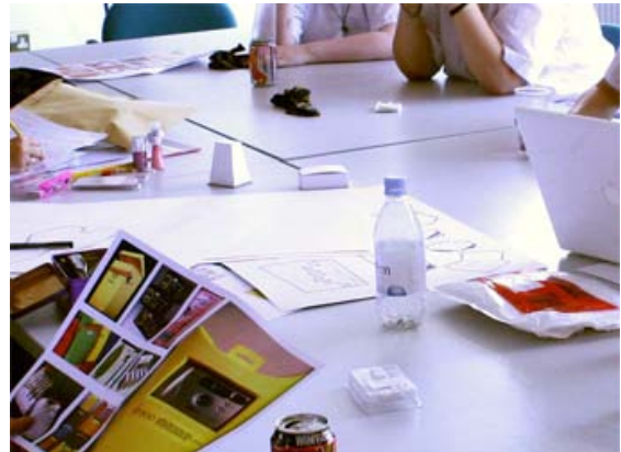
Figure 7 & 8 – Action Learning Sets. The REdGENERATION group meetings.

The primary aim of the pilot project with young people was to integrate a locally relevant strategic art programme into a new concept for enterprise in schools.