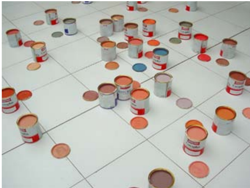
Figure 5 - The collection of visual evidence resulted in an art installation entitled '32 Reds' exhibited at the Glass Box Gallery, Sept-Oct 2003

collecting evidence from the site and surrounding landscape. An edited collection of site relevant art pieces was produced, which sought to reflect the reality of the environment. This resulted in exhibitions and installations at venues local within the regeneration area mostly focussed on an edited paint range. Haywood and Kennedy selected 32 shades of red from examining vertical surfaces and brickwork within a pre-designated catchment of the intended building. Increasingly, as the project has developed the colour range has been refined and re-edited. The Reds colour palette was successfully used to inform the colours and materials in the new Innovation Forum building.