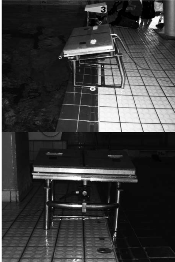
Figure 3 — The modified starting block.

angle. However, due to the dimensions of the force plate, the depth of the starting block was reduced by 7 cm. Force data were analyzed using Bioware version 3.24 (Amherst, New York) and upper limb data were analyzed using Biometrics Datalogger (Biometrics, UK) software.