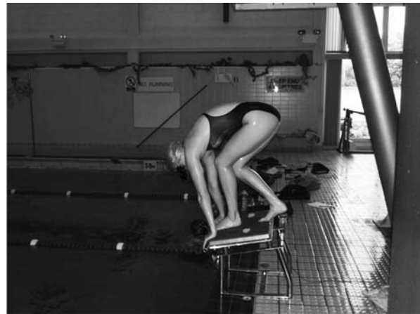
Figure 2 — The track start.

mounted to a 10-mm-thick aluminum plate that was bolted to the starting block frame, and the force plate feet were affixed to the aluminum plate. An aluminum T-bar handrail instrumented with a load cell (Biometrics, UK) was affixed to the front of the starting block to measure the force application of the upper limbs (Cavanagh et al., 1975). The load cell was mounted inferiorly to the center of the T-bar handrail to minimize force measurement error during the one-handed track start (Figure 3). The modifications made to starting block did not significantly alter its height, width, or