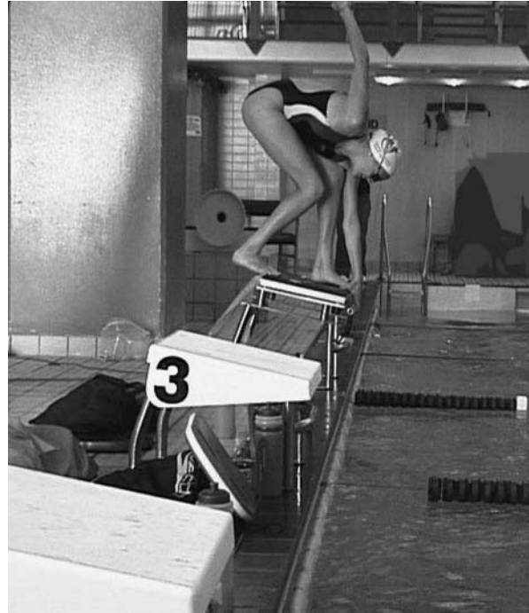
Figure 1 — The one-handed track start.

A portable multicomponent Kistler force plate with built-in charge amplifier (9286AA, Amherst, New York) sampling 500 Hz (600 mm \times 400 mm \times 35 mm) measured the ground reaction forces. The force plate was