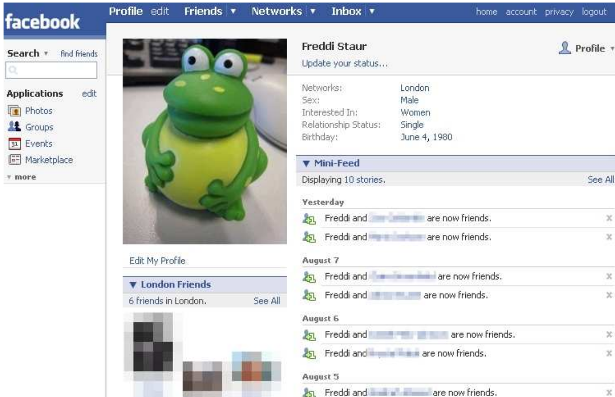
Figure 2: Freddi Staur's Profile

“Draker alleged that the parents negligently failed to supervise their children's use of the internet. She claims that both sets of parents knew of their children's animosity for Draker, and their tendency to misbehave, and had furnished their children with computers (the 'instrumentality utilized by their children to create the MySpace page'). Draker claimed that as a result of the publication, she had suffered emotional distress and mental anguish and had incurred medical expenses and lost wages.” (Dardia 2007)