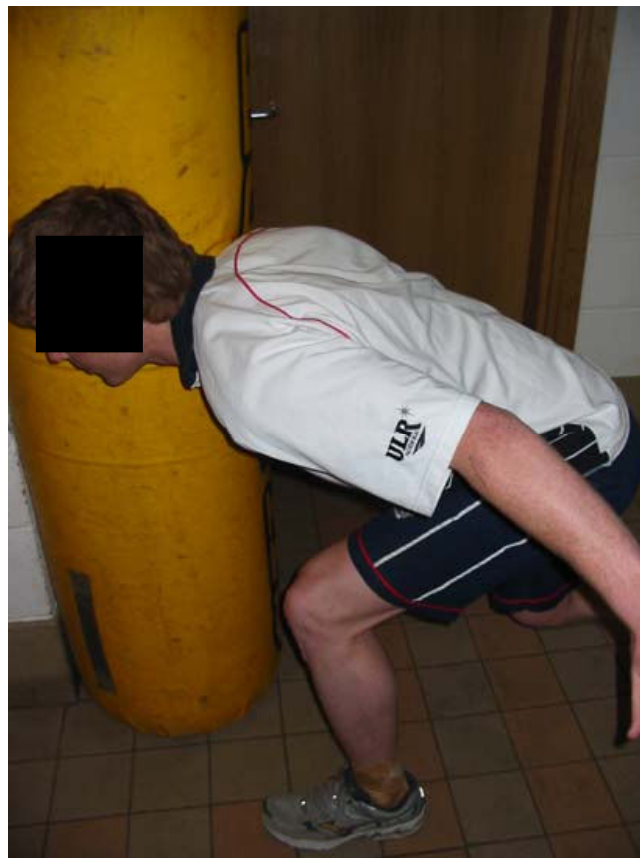
Figure 2 Foot and body position at contact.

Data were analysed using the statistical software package SPSS (version 12). Differences in time of onset between muscles were analysed with a factorial ANOVA with two factors (side (left or right) and muscle). The critical alpha level chosen \alpha = 0.05 for all analysis. Paired t-tests were used to evaluate specific differences found (corrected for family-wise inflation of type 1 error with Bonferroni corrections). In order to assess the test-retest reliability of the muscle onset timing, the second and the fifth repetition for each subject for all muscles was compared using intra-class correlation coefficient (ICC) to assess both the