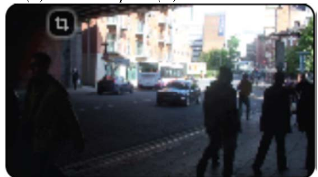
(d) Busy road