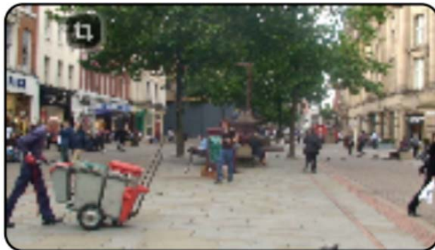
(a) St Ann's Square (A)