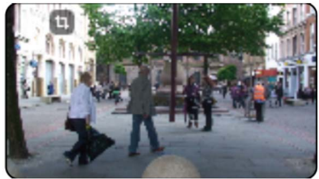
(b) St Ann's Square (B)