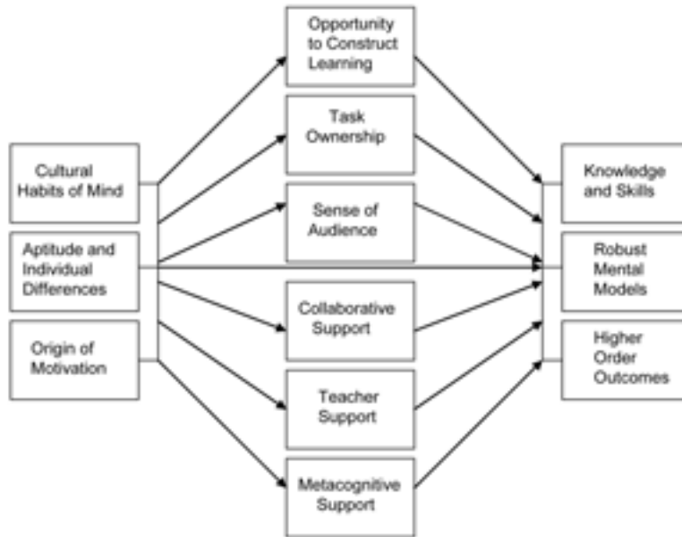
Figure 1. Reeves's (1997) model of World Wide Web based learning.

‘Origin of Motivation’ of each learner. An ‘extrinsic’ motivation could be due to, for example, a learner obtaining a vocational qualification in order to gain employment. An ‘intrinsic’ motivation can occur where knowledge and/or skills are gained due to interests in problem-solving and/or carrying out various tasks. He argues that by its very nature, the World Wide Web will promote ‘intrinsic’ motivation due to its relatively new educational use, multimedia capabilities and ability to offer greater learner control.