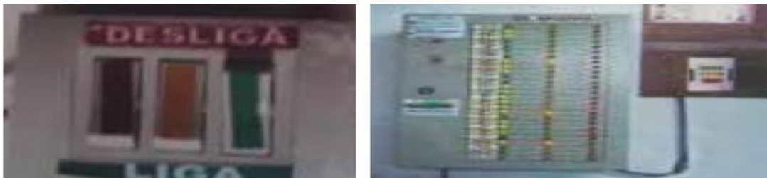
Figure 2: Example of Analysed Case (No. 86) (after Tezel et al., 2010)