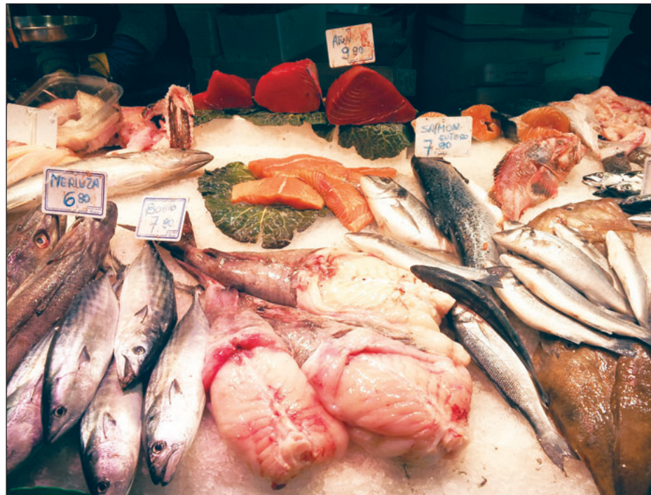
Figure 2. A typical European fishmonger's display (Barcelona, Spain). Popular aquaculture finfish products (salmon, gilthead sea bream, sea bass) are on sale alongside produce from wild catches, such as tuna loins (in the background), hake, Atlantic bonito, and monkfish (in the foreground).

Europe and North America play similarly influential roles in the world's seafood trade (FAO 2014), with substantial impacts on natural resources and the global economy. Both regions also act as pivotal research hubs for scientific advancement in this field; thus, positive breakthroughs achieved in Europe and the US are likely to result in positive change at the global level. Undoubtedly, even a small percentage of mislabeled seafood products available in the market have undesirable consequences for human health, the economy, and the environment. Furthermore, greater challenges lie outside the bounds of the mainstream retail sector (Figure 2); restaurants (including “carry-out” or “take-away” options) and other food services are subject to relatively fewer labeling regulations and to reduced enforcement (Mariani et al. 2014), and arguably represent the next target for a standardized assessment of seafood substitution (Kappel and Schröder 2015). Yet the scenario emerging from this Europe-wide assess-