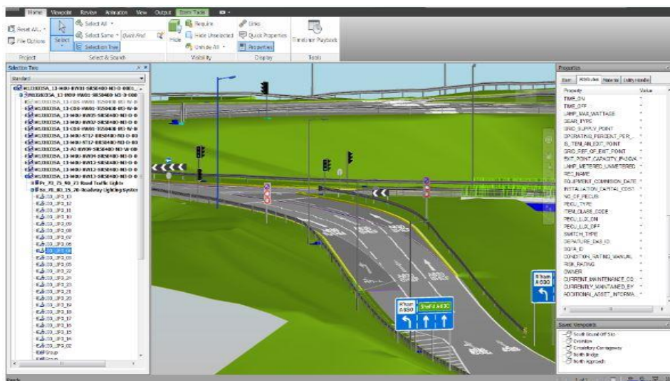
Figure 2: Screenshot of the M1J33 BIM Model (Mouchel Consulting,2015)

January – April 2014. The project team worked with the management team and supply chain through collaborative monthly workshops, to develop the model which contains detailed design and contractual information, existing management asset data, pavement data, as-built information and the contents of the Health and Safety File. Good collaborative relationships were maintained throughout the development and construction phases of the project between all parties. This led on to a smooth handover of the scheme into maintenance, due in part to the development of the BIM model. The model is now being used as an asset maintenance tool for the first time in the country. Important lessons learned include; (i) current HE databases are very high level and do not capture the granularity of data available, as required by the maintainers, (ii) further work is needed to capture all stakeholder requirements, so that a comprehensive recording system can be developed, which will enable maintainers and stakeholders to better interrogate and use captured data.