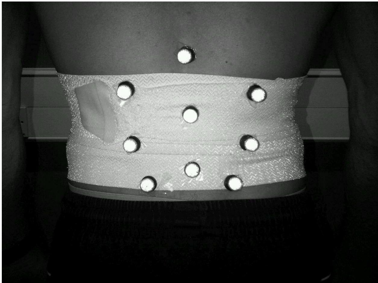
Figure 1a. The full seven markers used to track the motion of the lumbar spine. The reduced marker set consisted of the four markers positioned lateral to the spine.

Two possible configurations of lumbar tracking markers were tested. With the first set (proposed by Seay et al. (2008)) a total of seven markers were used to track this segment. With this approach an elasticon bandage is first wrapped around the lumbar region and three markers placed over the bandage: on the T12-L1 joint space, on the L5S1 joint space and midway between these two markers. Four more markers are then positioned either side of the midline markers (Figure 1a). As explained, this configuration can be difficult to track continuously with a passive capture system and therefore an alternative configuration, consisting of only the four markers positioned away from the spine, was tested. Two possible marker configurations were also compared for tracking the thoracic segment. The first set consisted of a small rigid plate with three non-collinear markers mounted at the top of the sternum (Figure 1b). The second marker configuration also consisted of three markers, two positioned bilaterally on the acromioclavicular (AC) joints and a third over the T12L1 joint space.