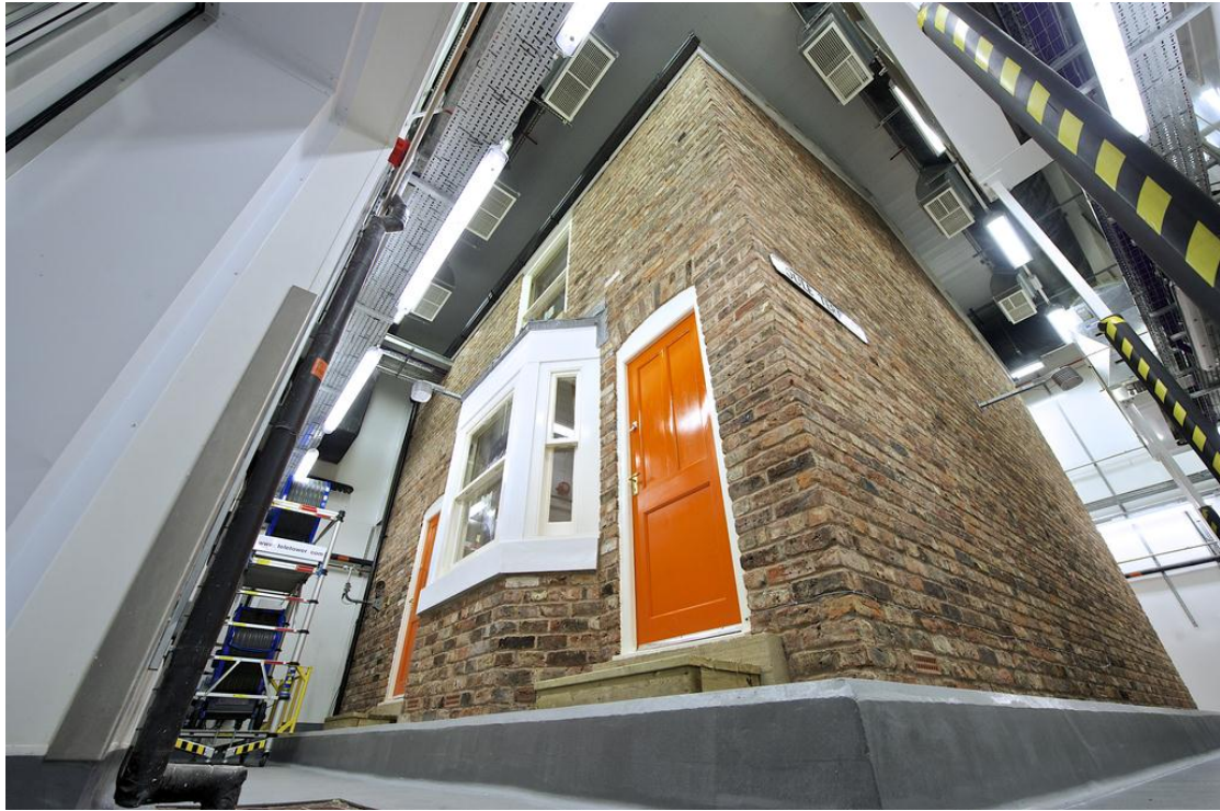
Figure 1 – Salford Energy House