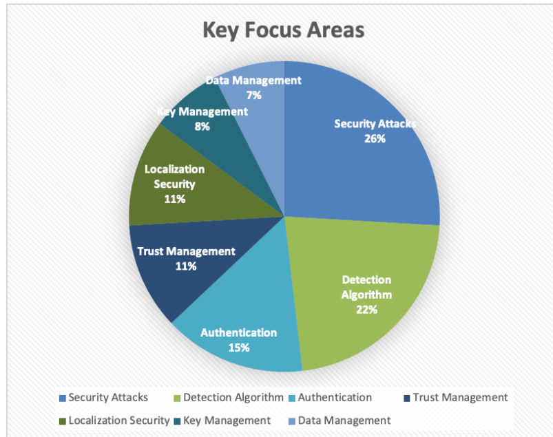
FIGURE 2 Focus Areas

variation between WSNs and UWSNs. A mobile UWSN was simulated under varying mobility rates to analyse the impact of out-of-coverage problems. They also simulated a flooding attack and measured the performance of the network under varying malicious node densities. They found that there was a high level of degradation in performance during attacks. Mian and Kumar 24 discuss the security requirements, threats and challenges in UWSNs. They also discuss active and passive attacks to UWSNs.