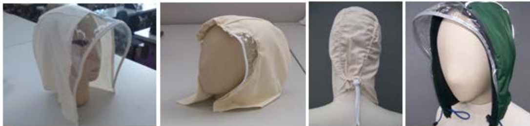
Fig. 2: Case study level 5 (2007-2008)