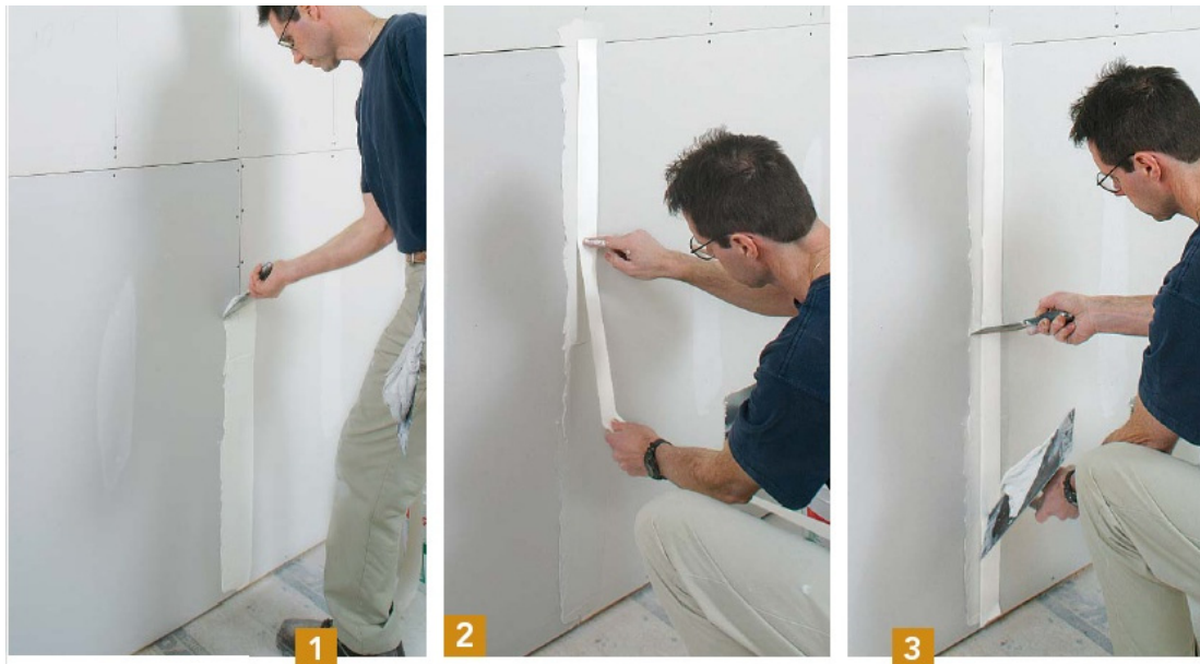
Figure 3: Plasterboard Fastening and Joint Finishing (Ferguson 2004)