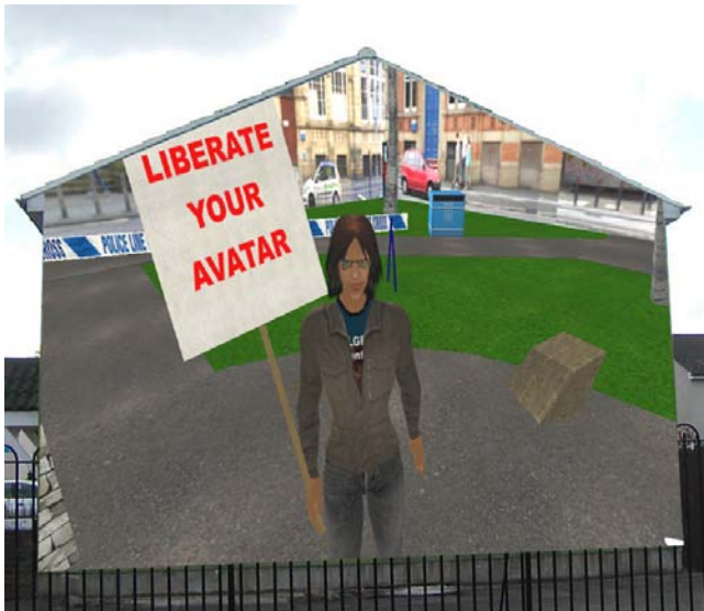
Fig 4. Proposed Second Life projection for ISEA Belfast 2009

The installation was located on the regenerated landscape of the Waterfront Plaza Belfast, directly outside the newly developed concert hall building. This utilitarian environment was used as a stage set to represent an augmented garden that explored the concept of boundaries and territories, a virtual plaza encapsulated by the ironies, contradictions and obscurities of a divided city, and a metaphor of Belfast's social history. As the participants walked through this urban landscape, both first and second life inhabitants came 'face-to-face' on screen, in the form of a live digital mural projected on the façade of the Waterfront building. This mural formed the central focus of the installation and immediately spoke of the infamous painted murals on houses across West Belfast. Those depict a deep political divide, but post-conflict society now refers to them as a stark reminder of recent troubles, and thereby maintaining the peace that now prevails. In a city such as Belfast it would be impossible to evade such references when projecting images onto a building, as though the project itself were projected onto the gable end wall of a house on the Falls Road or the Shankill Estate.