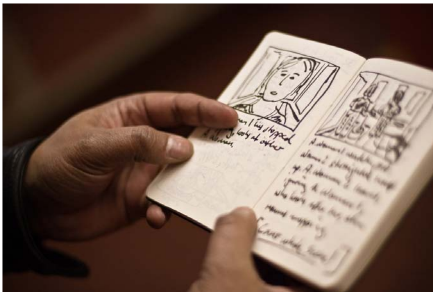
A storyboard page from The Silent Accomplice (2010)

Abundance could well be a sign of health. It is certainly a sign of wealth - physically and metaphorically. Abundance is, by definition, somehow quantitative. In an abundant society we are rich and possess riches and we determine this in numbers: money, barrels of oil, number of art galleries, cinema attendances, number of films produced, company turnover, profit margins and so on. In all spheres, numbers have proliferated and emerging out of this is the dominance of the science of matrixes and statistics. Increasingly, in a world of abundance, we assign value through matrixes and statistical analyses 4 .