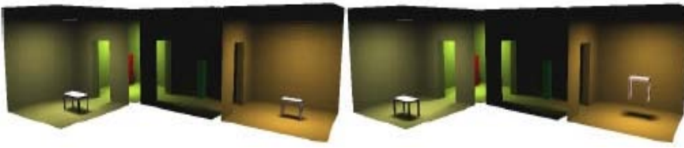
Figure 2: Examples of a rendered scene and object motion in the lighting Simulation