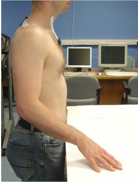
Figure 1: Measurement setup during the ironing task. Subjects had to alternately touch two dots on a solid horizontal in front of them. Two linear arrays of eight electrodes were placed on the sternocleidomastoid muscle and the trapezius muscle of the dominant side.