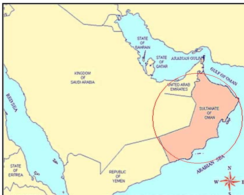
Figure 1: location of the Sultanate of Oman