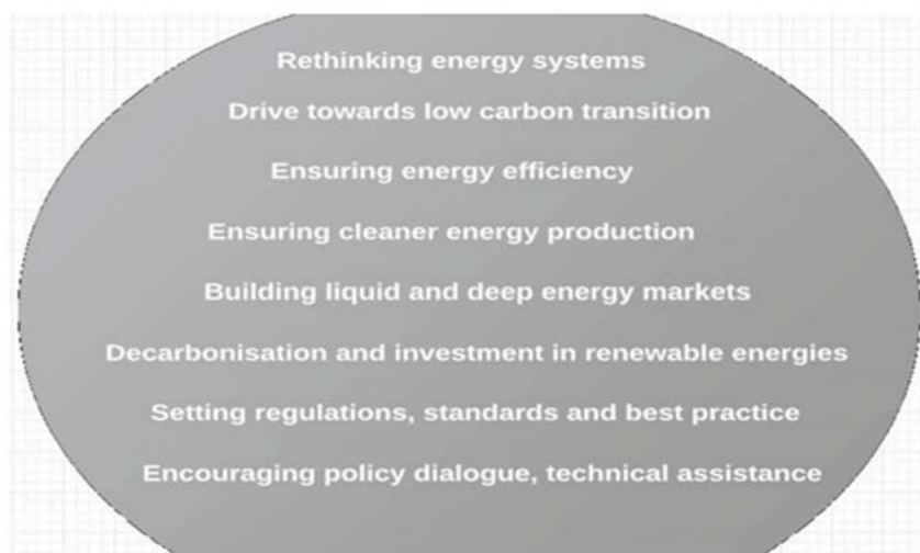
Figure 1 UN Millennium SD goals for Nigeria

Udoh (2015) thinks that being an oil-dependent economy has led to an overuse of wood fuel by more than 70% of Nigerians living in rural areas. Consequently, high rates of deforestation, erosions and floods are expected (Oyedepo, 2012). In response, The UNOSD has developed eight SD goals for Nigeria in 2016 (see Figure 1).