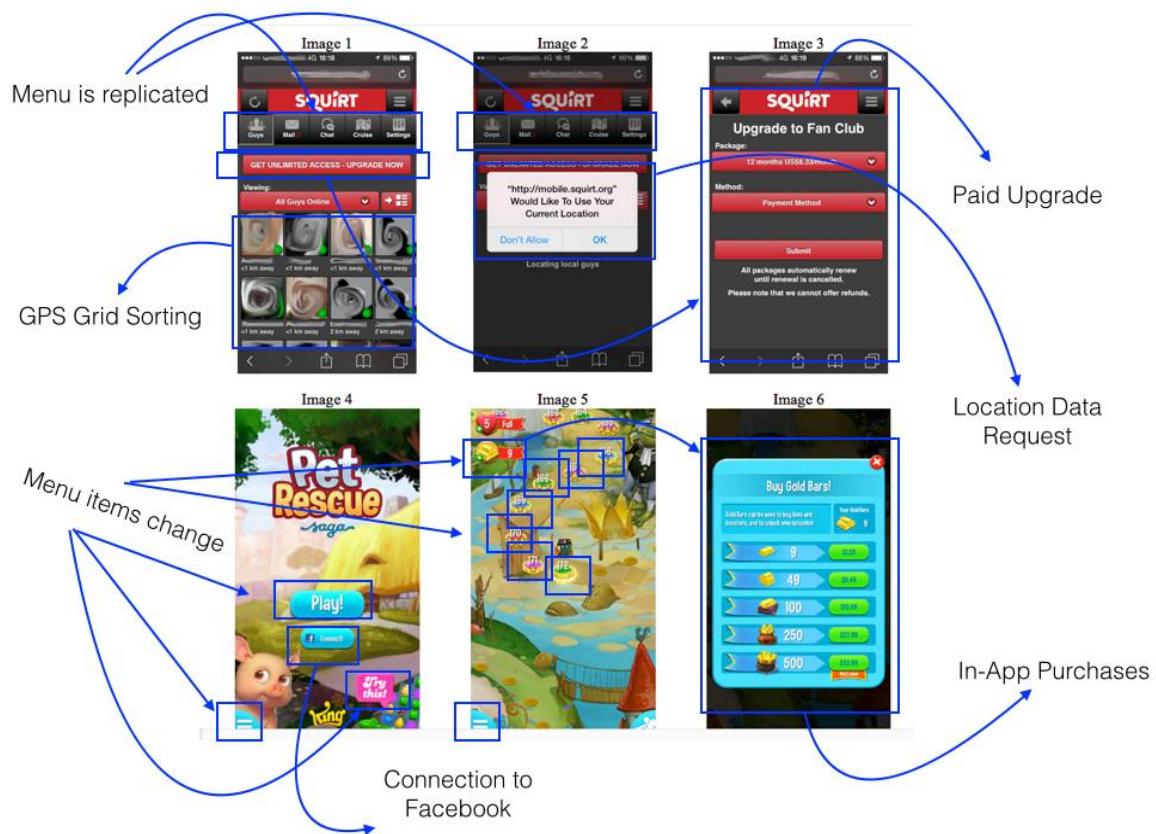
Figure 2. Comparison of Squirrt and Pet Rescue Saga

The app’s menu can be used initially to trace mediators. All apps have a menu system but this may not be presented in an obviously structured fashion. Considering interface arrangement, it is possible to clearly see Squirrt’s structuring as it uses tightly organised navigation text and images to guide users. The navigation structure remains the same at deeper levels (images 1 and 2). Menu icons are also key features that can symbolise cultural representations. Squirrt’s inclusion of a ‘cruising’ tab with a treasure map references a history of gay men meeting covertly in semi-public spaces (Mowlabocus, 2008). These icons and the app’s aesthetic include red as a colour of excitement but grey dominates. This provides a serious tone, emphasising the app’s streamlined functionality that digitally mediates cruising, shifting it into a more precise, private activity than its offline practice.