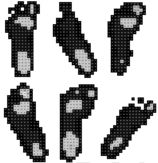
Figure 2. Representative 6 peak pressure steps plantar pressure of the total 24 analysed from infant 2.