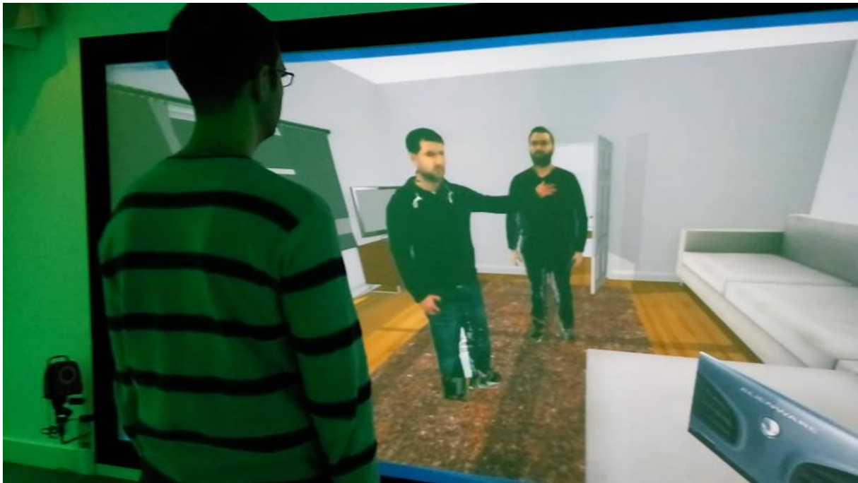
Figure 3. A mock up of a client fixating on a virtual threat and the therapist stepping in front of it. The therapist (centre) is reconstructed in real time across the telepresence link.

and behind to see the back of the virtual room the client looks into. The “therapist” appears in the foreground of the partially shared virtual space, as seen by the “client”.