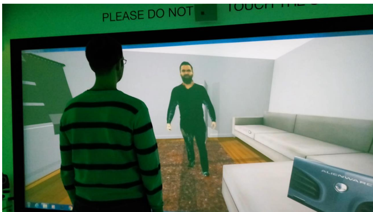
Figure 2. The client in the foreground is approached by a threatening other. The threat is a pre-recorded 3D reconstruction of someone approaching aggressively.

Our approach is to share a virtual context through large displays while using video based reconstruction to recreate both the therapist and, in this case, the threat. In another case the threat might be completely virtual. The concept is that the therapist can interpret both attention and emotion of the client through non-verbal signals and use non-verbal communication to direct the client's attention and, by doing so, manage emotion their emotion.