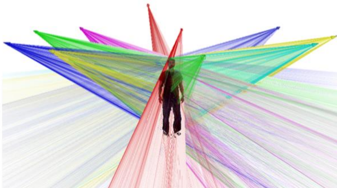
Figure 1. 3D reconstruction of a human in our telepresence system, showing lines from each camera derived from silhouettes.

space and eye gaze although this has not been tested with rigour. ICVEs can be said to faithfully communicate spatial but not visual aspects of non-verbal behaviour.