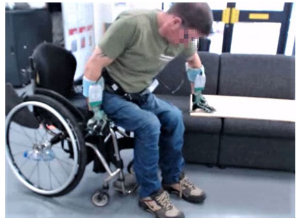
Fig. 2 Set-up of the experiment

eliminated from the calculation of transfer mean. This threshold was arrived at after consulting the video and concluding that forces under 20 N were often due to baseline noise of the sensors or to contact between the hands and other surfaces (hands resting on thighs).