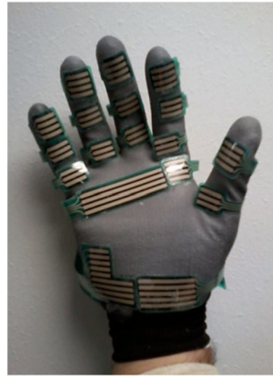
Fig. 1 Position of the sensors on the force sensing glove

Analysis of the Tekscan data was completed using a custom Matlab script (Matlab 2015b, Mathworks, Inc., Natwick, MA, USA). Reaction forces were normalised as a percentage of body weight as previously recommended by [5]. The gloves were calibrated according to the manufacturer instructions. For each transfer, the peak and mean forces above a threshold of 20 N were calculated for both leading and trailing hand. Force values <20 N were