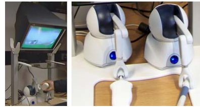
Figure 2. Using PhanToM Omni Force feedback joysticks as an ultrasound probe and virtual needle.

Although validated needle insertion simulations have been produced, none as yet lead directly on to the next stage of an IR procedure, guide wire manipulation.