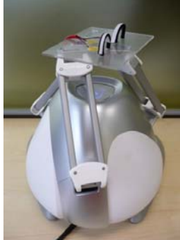
Figure 1. Palpation device combining force feedback from a NoviNT Falcon and tactile feedback at the fingertips from piezoelectric materials.

small audio speaker, pin arrays, and pneumatic solutions. Practically, stimulating each of the fingertips' receptors as stimulated in a real palpation is infeasible, however, and an approximation using a force feedback device combined with a mannequin like end effector appears to currently provide the best tradeoff between cost and fidelity.