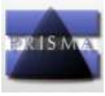
Figure 1. PRISMA Flow Diagram