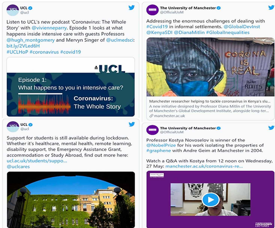
Figure 2. Curated Tweets Image 2