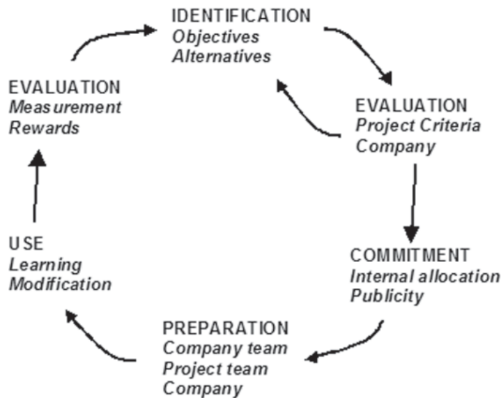
Figure 1: Innovation adoption process (Slaughter 2000).

A general innovation adoption process, as represented in Figure 1, consists of a cycle of implementation stages and activities. The implementation cycle consist of six stages: identification, evaluation, commitment, detailed preparation, actual use, and post-use evaluation (Slaughter 2000). Usually implementation processes may proceed through each of the stages. However, in certain cases the evaluation stage may reveal new criteria which need to be reconsidered in the identification stage and these two stages may cycle through a few repetitions.